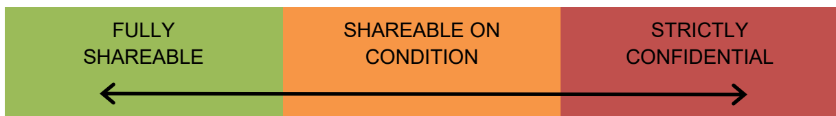
Figure 1: Data shareability continuum

In the following sections, we will focus on different ethical considerations – not exhaustive – to take into account when processing data. The idea is to draw the attention of researchers to the necessary trade-offs to make data as open as possible while ensuring an adequate level of protection.